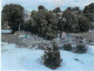
Example of litter found stuck in vegetation off landfill property that has been piling up for years.