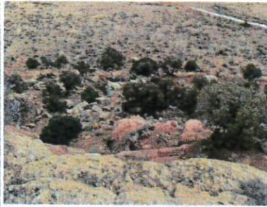
Example of litter found at bottom of cliff off landfill property that has been piling up for years. This was approximately 0.35 miles away from the landfill.