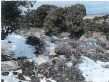
Example of litter found stuck in vegetation off landfill property that has been piling up for years.