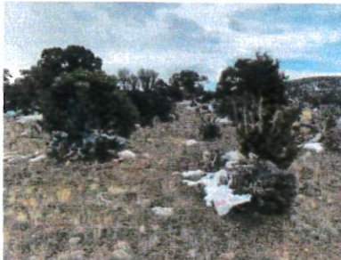
Example of litter found stuck in vegetation off landfill property that has been piling up for years.