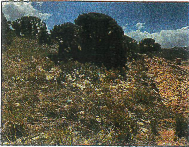
Litter along the edge of work area and in adjacent vegetation