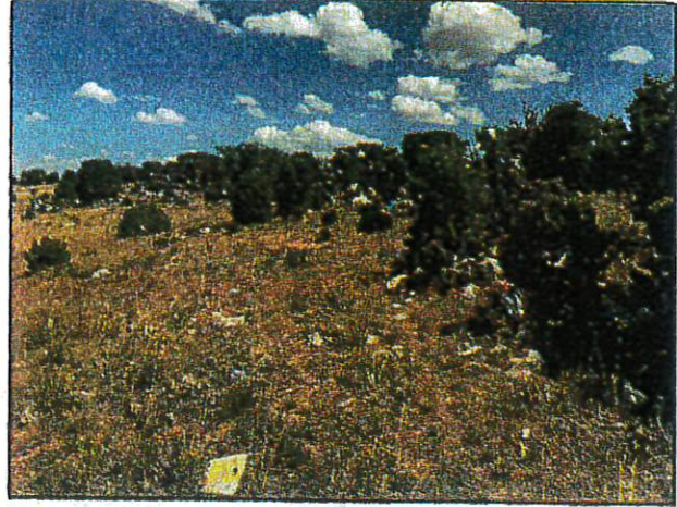
Litter along edge of grass and tree line