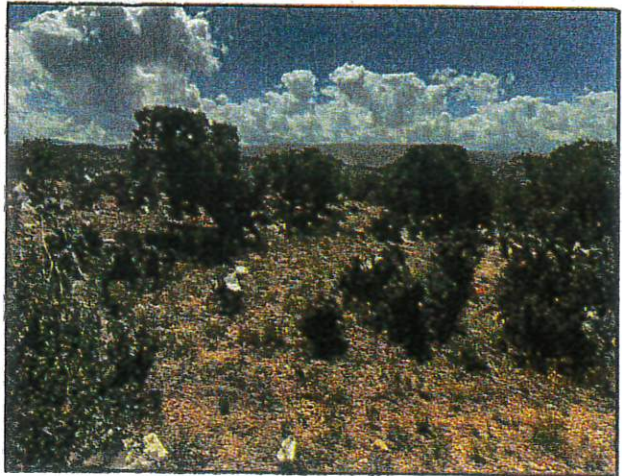
Litter caught in vegetation SE of open cell and work area